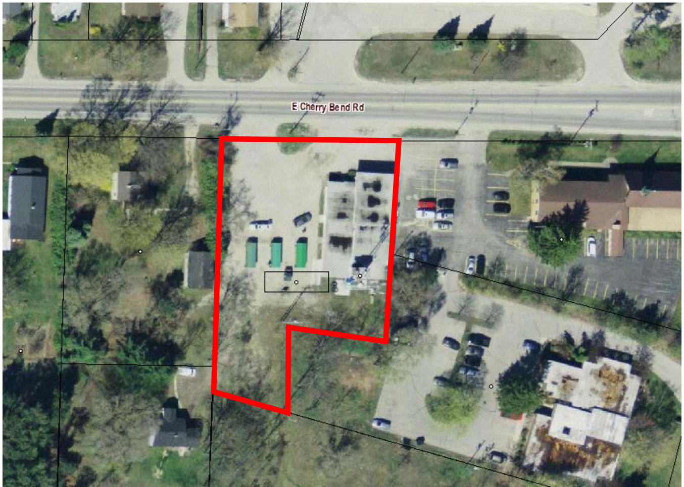
Aerial View of Property Lines